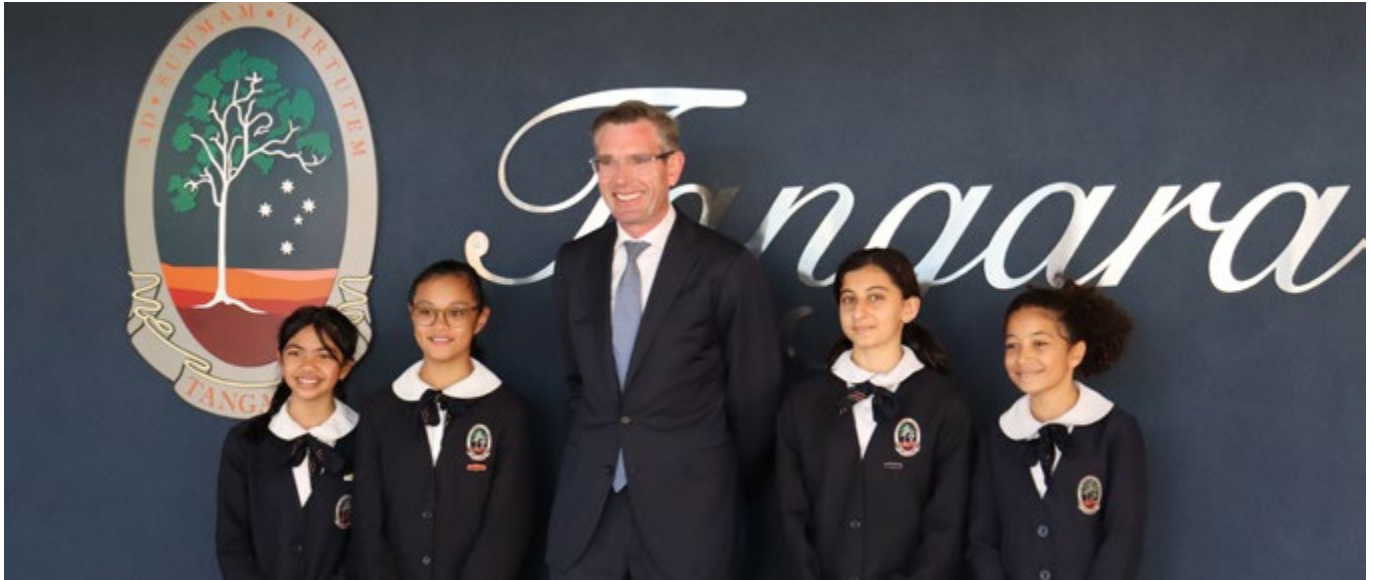
A visit from the Honourable Mr Dominic Perrottet

girls to take ownership of their choices and behaviours, helping them grow into responsible individuals who understand the significance of their actions and their impact on the wider community. Overall, our school camps provide a transformative platform that nurtures respect and responsibility, equipping our young girls with essential life skills to navigate the challenges of the future with confidence and integrity.